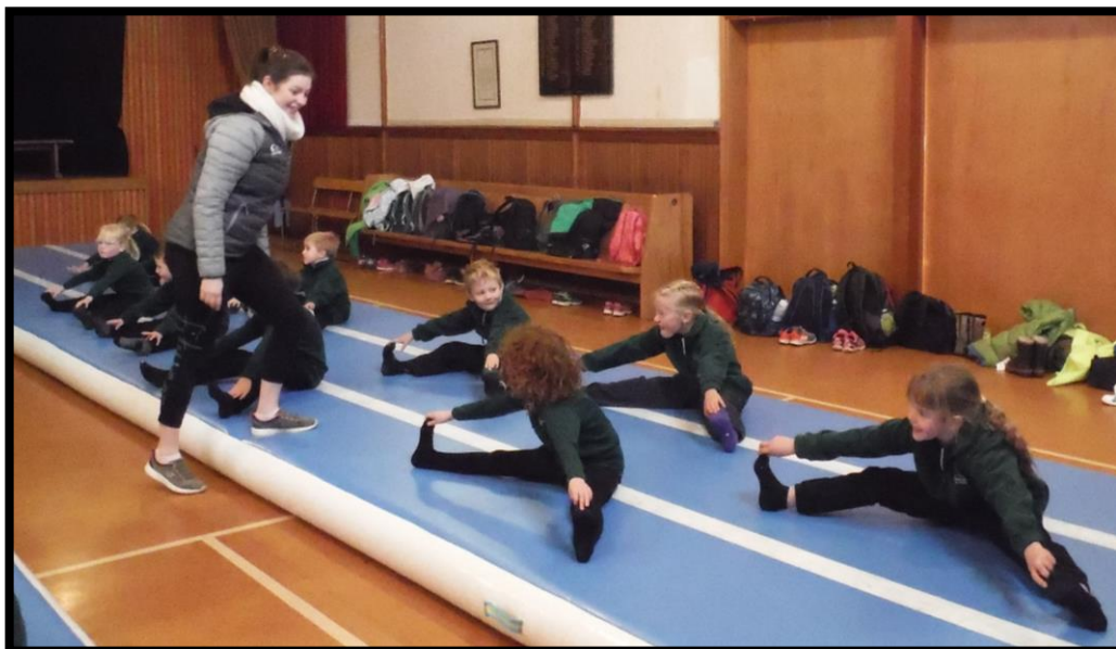
Years 1 – 3 show how flexible they are and we once were!!!!