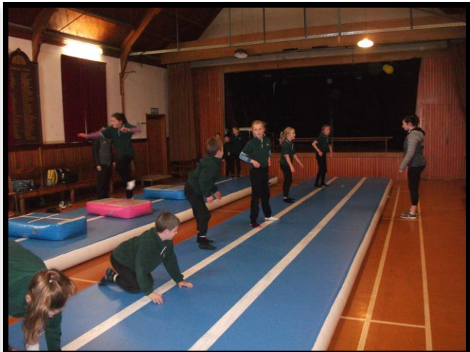
Years 4 – 6 practise their skills at the Hororata Hall