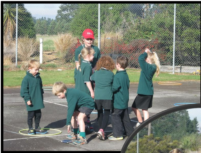
PALS - Physical Activity Leaders