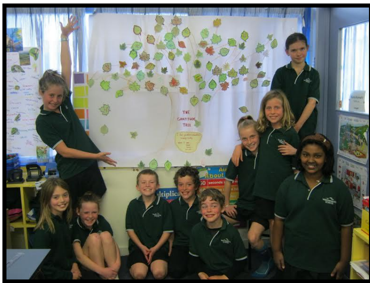
Room 2 with their wonderful Gratitude tree full of beautiful messages on autumn leaves.