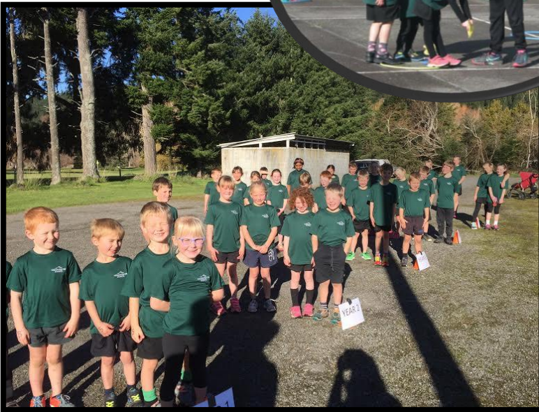
Look how smart the whole school looked in their Sports uniforms kindly donated by Richards Consulting Engineers Ltd