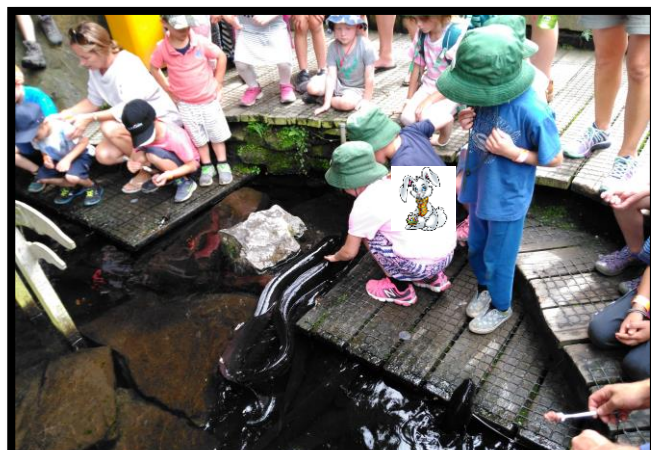
Room 1 trip to Willowbank feeding the eels!