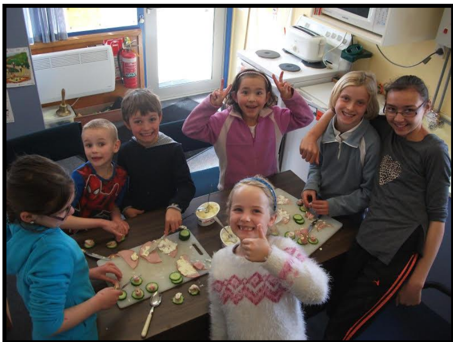
FRIDAY FOOD FUN!!!